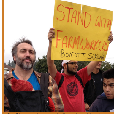
CAGJ marches with Familias Unidas por la Justicia in Skagit Valley.