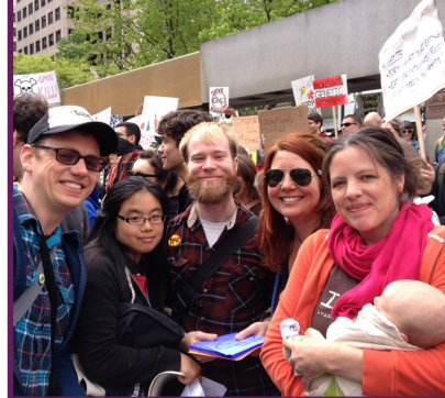
CAGJ and AGRA Watch join thousands at the March Against Monsanto.