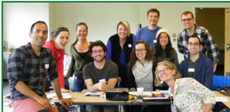
Food Justice Project Train the Trainer for our new Educate for Action workshops!