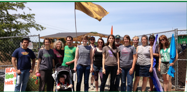
Food Justice Project Hike-a-Thon exploring food justice on Beacon Hill.