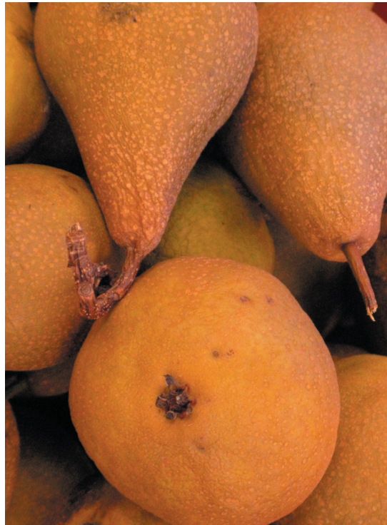
Local pears served at December Teach-in, 'Confronting the Food Crisis'